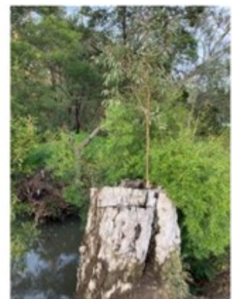
A shoot will come up from the stump of Jesse; from his roots a branch will bear fruit. Isaiah 11:1

municating to have hope and it also challenged me to see how I could bring life to others. From this I decided on one action connecting with someone who is struggling at the moment.